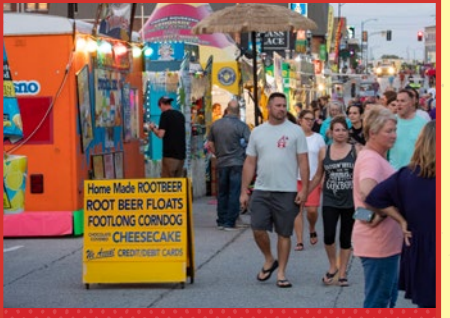
Food Mouth-watering delicacies, thirstquenching beverages & specialty snacks & desserts