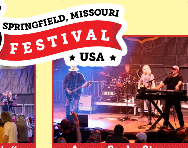
Aaron Sachs Stage Hot artists playing cool jams all weekend long!