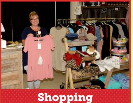
Huge variety of onsite vendors, plus a wide array of boutiques, art galleries, & shops in SGF's vibrant downtown