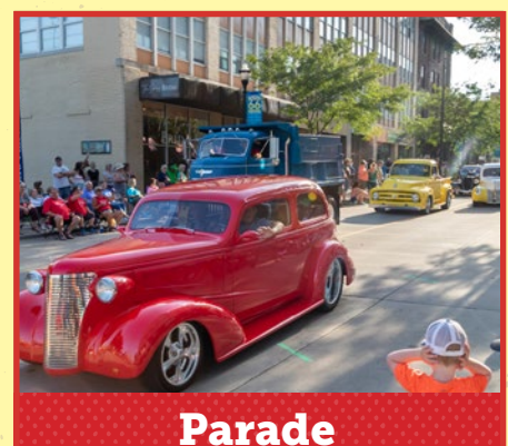
Friday, 6 p.m.